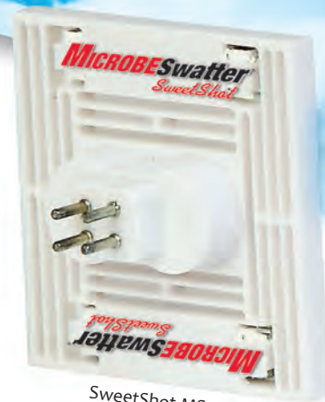
SweetShot MS24OZ GFI #4450

The MicrobeSwatter ® MS24 (GFI #4440) & MS24OZ (GFI #4450) features a patent pending magnetic mounting plate. Simply cut a hole, affix the lamp to your HVAC system & you're done! Powerful magnets securely hold the mounting plate in place and make installation and lamp replacement a snap! You don't have to unscrew or unfasten the unit to replace the lamps – simply remove the lamp and insert a new one!